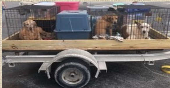
These are just a handful of the courageous animals rescued by Aztec Airways

After discovering this incredible company and their mission to help and serve our community locally and globally, we were impressed with their commitment to serving those in need; people as well as animals in need of rescuing. Currently, Aztec Airways is flying into all areas of the Bahamas, transporting supplies and passengers for evacuation and rebuilding for Hurricane Dorian relief.